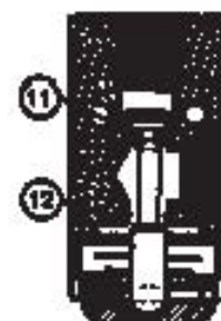
3 WAY AIR VALVE 270012 Exhausts to atmosphere