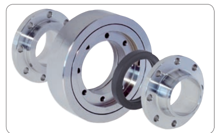
EMCO WHEATON carbon steel swivel joint with flame hardened ball race way for a long life time!

For more details see our data sheet swivel joint D2000 .