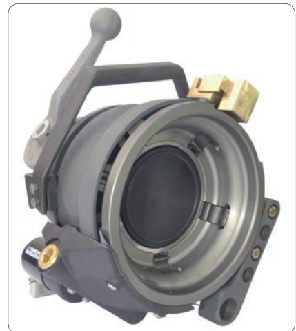
API coupler For more details see our data sheet API couplers K2 and K2P.